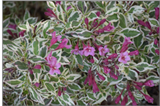
My Monet Weigela flowers

My Monet Weigela is recommended for the following landscape applications;