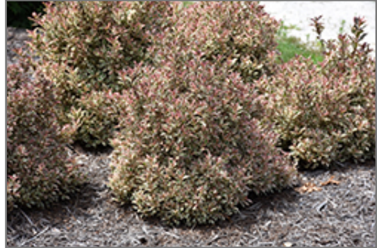
My Monet Weigela

My Monet Weigela makes a fine choice for the outdoor landscape, but it is also well-suited for use in outdoor pots and containers. It is often used as a 'filler' in the 'spiller-thriller-filler' container combination, providing a mass of flowers and foliage against which the thriller plants stand out. Note that when grown in a container, it may not perform exactly as indicated on the tag - this is to be expected. Also note that when growing plants in outdoor containers and baskets, they may require more frequent waterings than they would in the yard or garden.