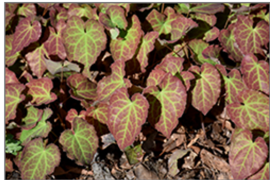
Froehnleiten Bishop's Hat foliage