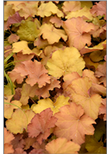
Caramel Coral Bells foliage

Caramel Coral Bells is recommended for the following landscape applications;