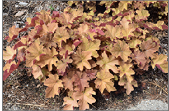
Caramel Coral Bells

Caramel Coral Bells will grow to be about 10 inches tall at maturity extending to 18 inches tall with the flowers, with a spread of 18 inches. When grown in masses or used as a bedding plant, individual plants should be spaced approximately 15 inches apart. Its foliage tends to remain low and dense right to the ground. It grows at a medium rate, and under ideal conditions can be expected to live for approximately 10 years. As an evergreen perennial, this plant will typically keep its form and foliage year-round.