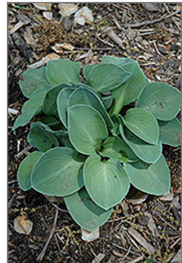
Blue Mouse Ears Hosta