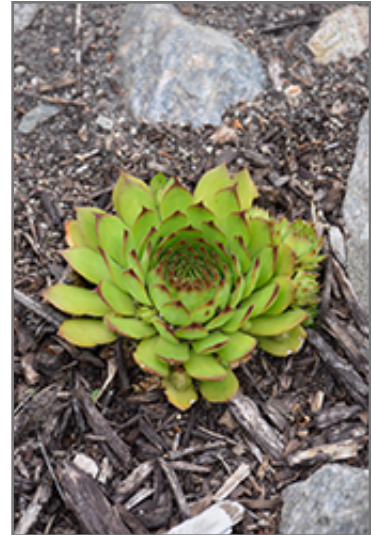
Sunset Hens And Chicks