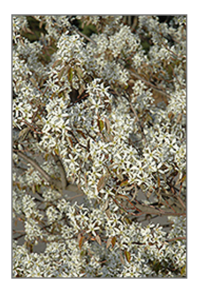
Shadblow Serviceberry flowers

This shrub does best in full sun to partial shade. It is quite adaptable, prefering to grow in average to wet conditions, and will even tolerate some standing water. It is not particular as to soil type or pH. It is somewhat tolerant of urban pollution. This species is native to parts of North America.