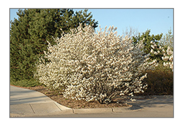
Shadblow Serviceberry in bloom

Shadblow Serviceberry is a multi-stemmed deciduous shrub with an upright spreading habit of growth. Its average texture blends into the landscape, but can be balanced by one or two finer or coarser trees or shrubs for an effective composition.