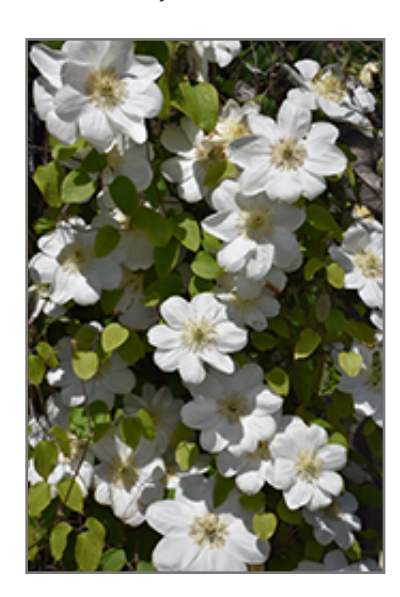
Guernsey Cream Clematis flowers