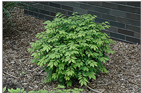
Little Moses Burning Bush