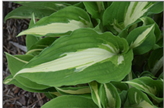
Night Before Christmas Hosta foliage