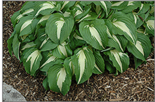
Night Before Christmas Hosta foliage

Night Before Christmas Hosta is recommended for the following landscape applications;