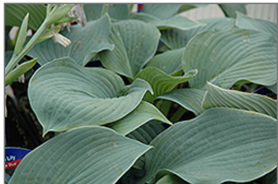
True Blue Hosta foliage