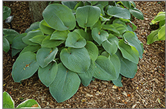
True Blue Hosta