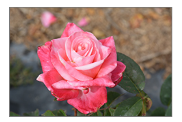
First Prize Rose flowers