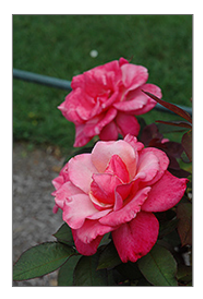
First Prize Rose flowers