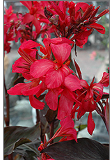
Australia Canna flowers