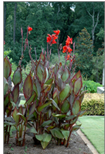
Australia Canna in bloom