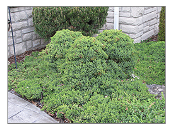
Dwarf Japanese Garden Juniper

Dwarf Japanese Garden Juniper is a dense multi-stemmed evergreen shrub with a ground-hugging habit of growth. It lends an extremely fine and delicate texture to the landscape composition which should be used to full effect.