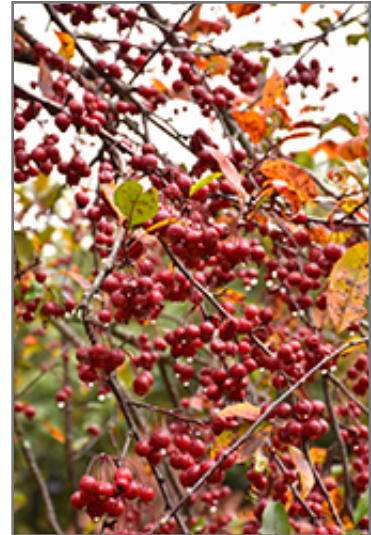
Prairifire Flowering Crab fruit

This tree should only be grown in full sunlight. It prefers to grow in average to moist conditions, and shouldn't be allowed to dry out. It is not particular as to soil type or pH. It is highly tolerant of urban pollution and will even thrive in inner city environments. This particular variety is an interspecific hybrid.