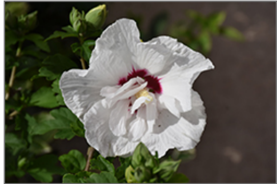
Bali Rose of Sharon flowers

Bali Rose of Sharon is recommended for the following landscape applications;