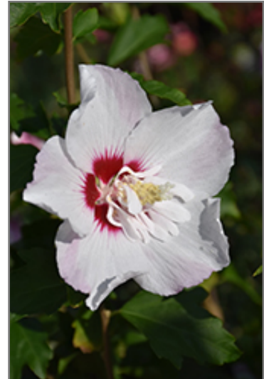
Fiji Rose of Sharon flowers

Fiji Rose of Sharon is recommended for the following landscape applications;