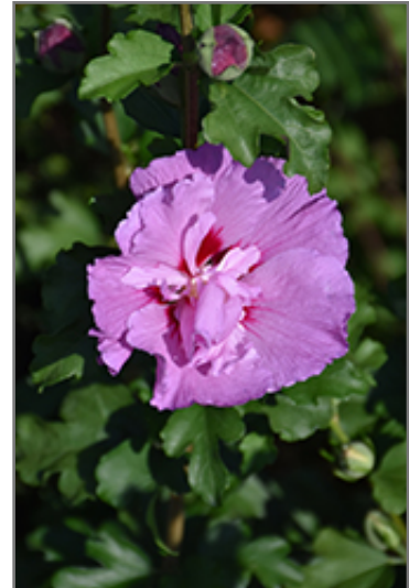
Tahiti Rose of Sharon flowers

Tahiti Rose of Sharon is recommended for the following landscape applications;