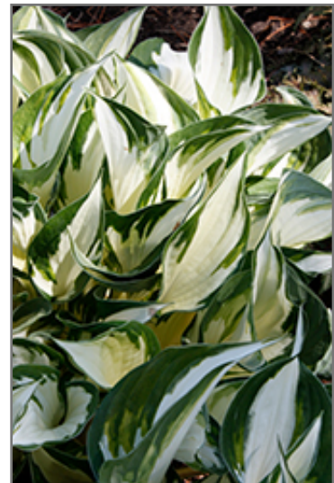
Fire and Ice Hosta foliage