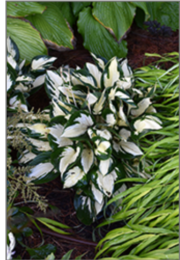
Fire and Ice Hosta

Fire and Ice Hosta is recommended for the following landscape applications;