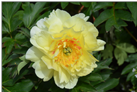
Bartzella Peony flowers

Bartzella Peony is recommended for the following landscape applications;