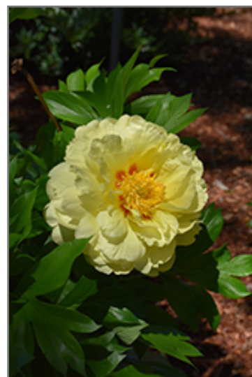
Bartzella Peony flowers