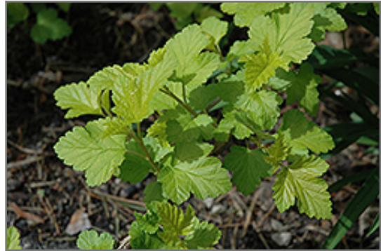
Common Ninebark foliage

Common Ninebark will grow to be about 10 feet tall at maturity, with a spread of 10 feet. It has a low canopy, and is suitable for planting under power lines. It grows at a medium rate, and under ideal conditions can be expected to live for approximately 30 years.