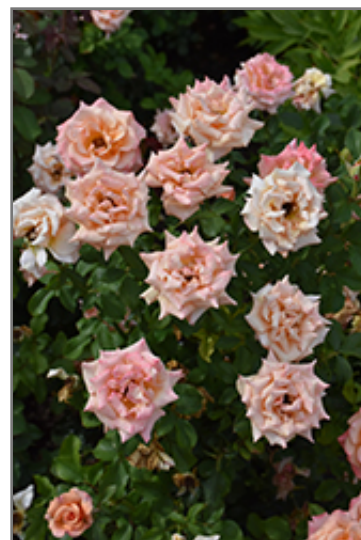
Singin' in the Rain Rose flowers