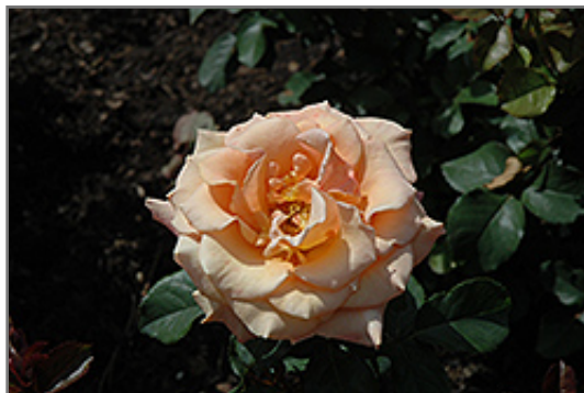
Singin' in the Rain Rose flowers

Singin' in the Rain Rose is recommended for the following landscape applications;