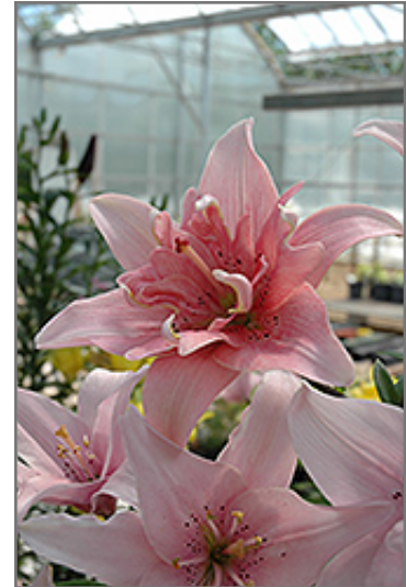
Elodie Lily flowers