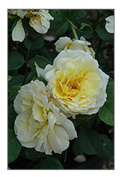
White Licorice Rose flowers