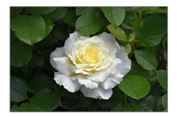
White Licorice Rose flowers