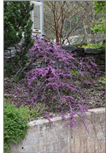
Ruby Falls Redbud in bloom