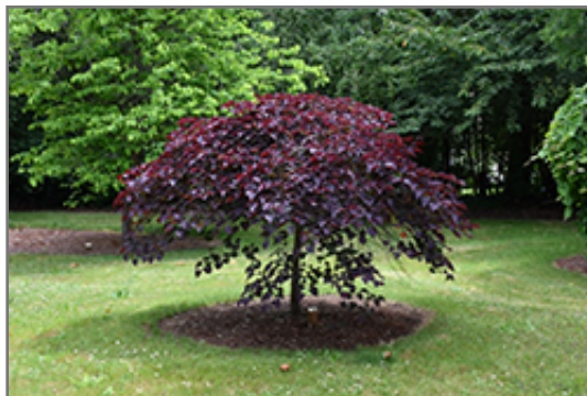
Ruby Falls Redbud

Ruby Falls Redbud will grow to be about 8 feet tall at maturity, with a spread of 6 feet. It has a low canopy with a typical clearance of 1 foot from the ground, and is suitable for planting under power lines. It grows at a medium rate, and under ideal conditions can be expected to live for 60 years or more.