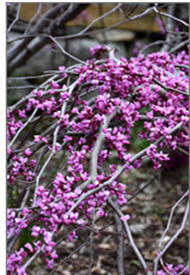
Ruby Falls Redbud flowers