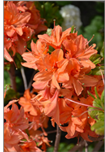
Mandarin Lights Azalea flowers