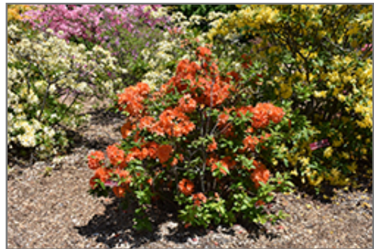
Mandarin Lights Azalea in bloom