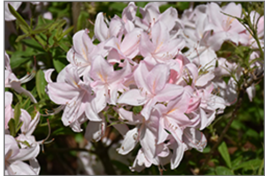
White Lights Azalea flowers