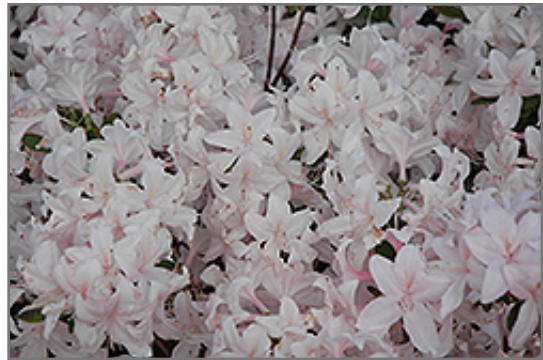
White Lights Azalea flowers