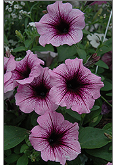
Supertunia Bordeaux Petunia flowers