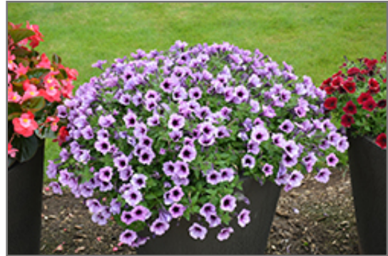
Supertunia Bordeaux Petunia in bloom

Supertunia Bordeaux Petunia is a fine choice for the garden, but it is also a good selection for planting in outdoor containers and hanging baskets. Because of its trailing habit of growth, it is ideally suited for use as a 'spiller' in the 'spiller-thriller-filler' container combination; plant it near the edges where it can spill gracefully over the pot. Note that when growing plants in outdoor containers and baskets, they may require more frequent waterings than they would in the yard or garden.