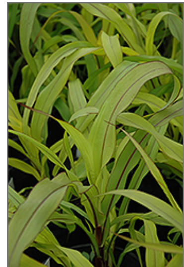
Jester Millet foliage