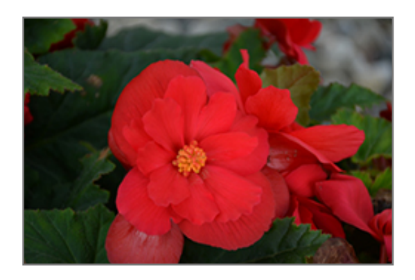
Nonstop Red Begonia flowers