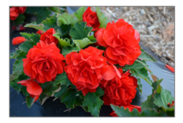
Nonstop Red Begonia in bloom

Nonstop Red Begonia is recommended for the following landscape applications;