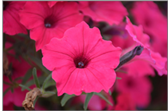
Supertunia Vista Fuchsia Petunia flowers