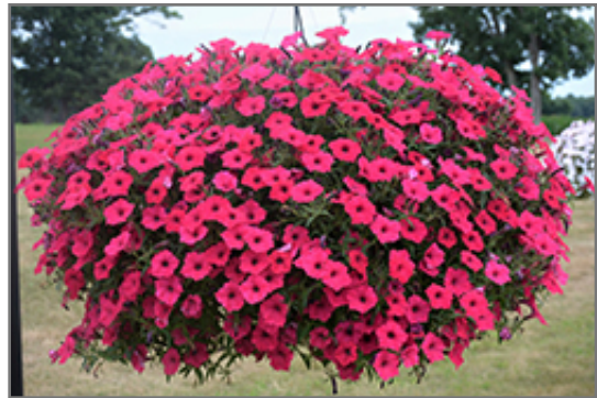
Supertunia Vista Fuchsia Petunia in bloom