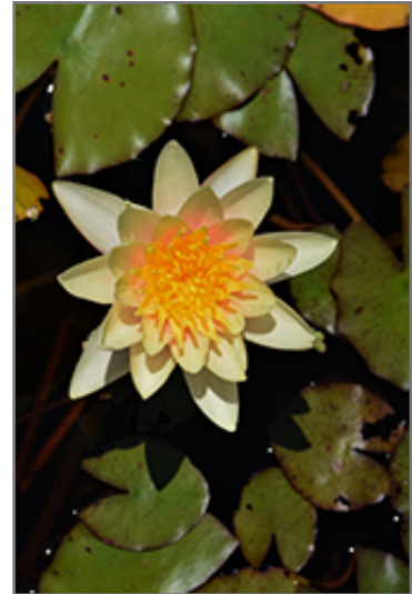
Comanche Hardy Water Lily flowers