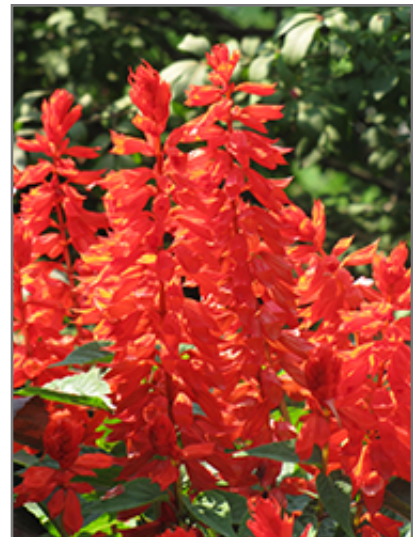
Lighthouse Red Sage flowers