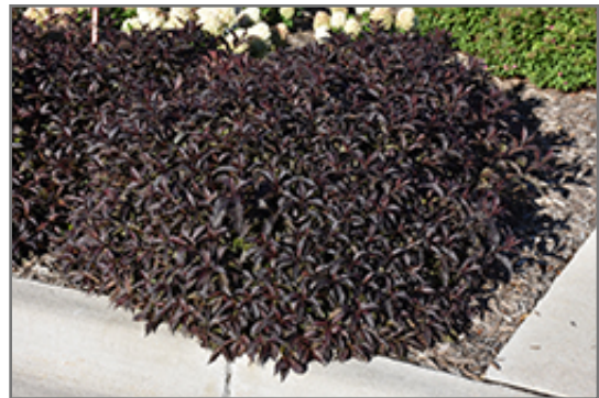
Spilled Wine Weigela