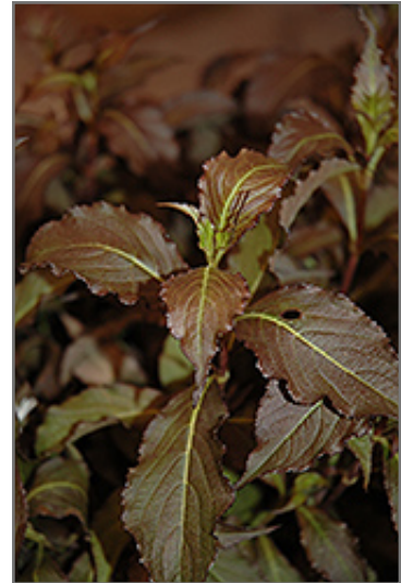
Spilled Wine Weigela foliage

Spilled Wine Weigela makes a fine choice for the outdoor landscape, but it is also well-suited for use in outdoor pots and containers. Because of its height, it is often used as a 'thriller' in the 'spiller-thriller-filler' container combination; plant it near the center of the pot, surrounded by smaller plants and those that spill over the edges. It is even sizeable enough that it can be grown alone in a suitable container. Note that when grown in a container, it may not perform exactly as indicated on the tag - this is to be expected. Also note that when growing plants in outdoor containers and baskets, they may require more frequent waterings than they would in the yard or garden.