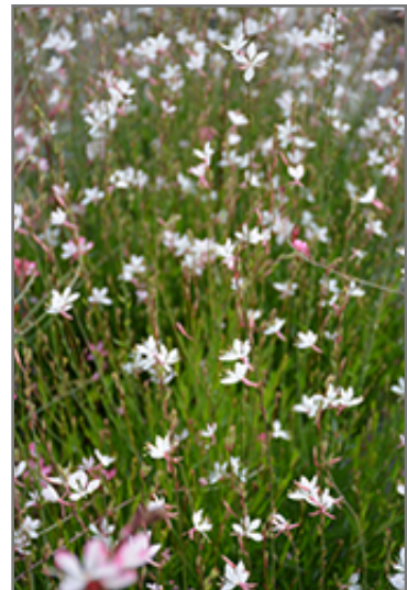
Ballerina White Gaura in bloom