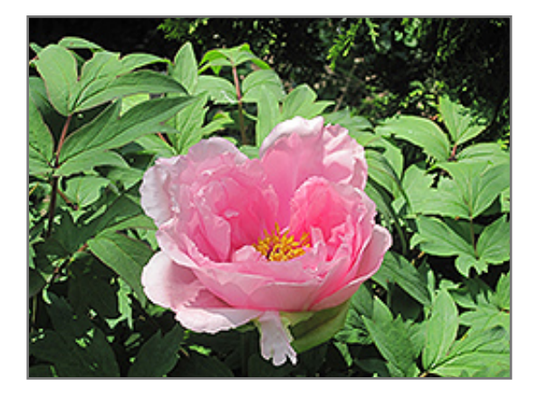
Hanakisoi Tree Peony flowers