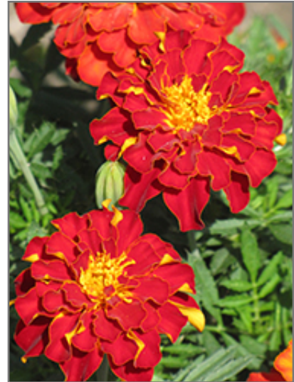
Safari Red Marigold flowers