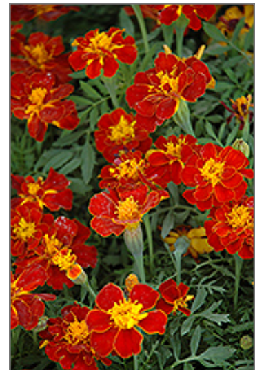
Safari Red Marigold flowers