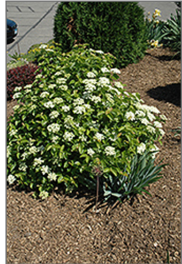
Blue Muffin Viburnum in bloom

This shrub does best in full sun to partial shade. It prefers to grow in average to moist conditions, and shouldn't be allowed to dry out. It is not particular as to soil type or pH. It is highly tolerant of urban pollution and will even thrive in inner city environments. This is a selection of a native North American species.