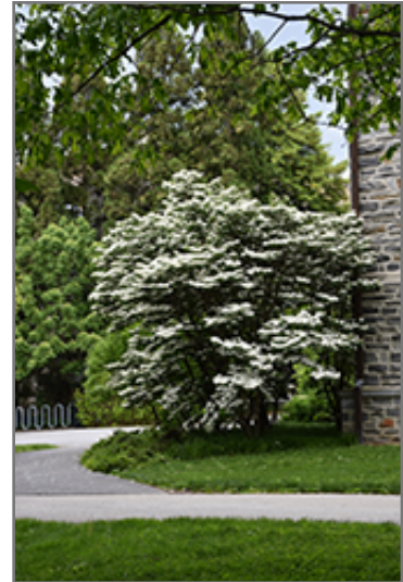
Summer Snowflake Doublefile Viburnum in bloom

Summer Snowflake Doublefile Viburnum is recommended for the following landscape applications;