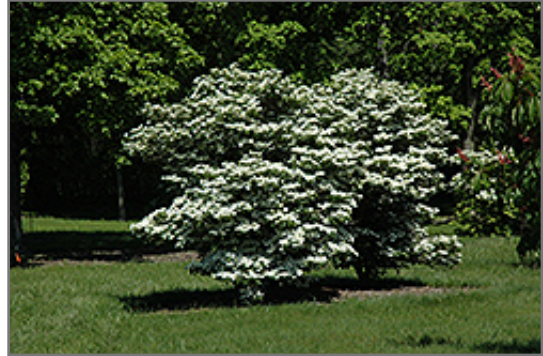
Summer Snowflake Doublefile Viburnum in bloom

This shrub does best in full sun to partial shade. It does best in average to evenly moist conditions, but will not tolerate standing water. It is not particular as to soil type or pH. It is highly tolerant of urban pollution and will even thrive in inner city environments. This is a selected variety of a species not originally from North America.