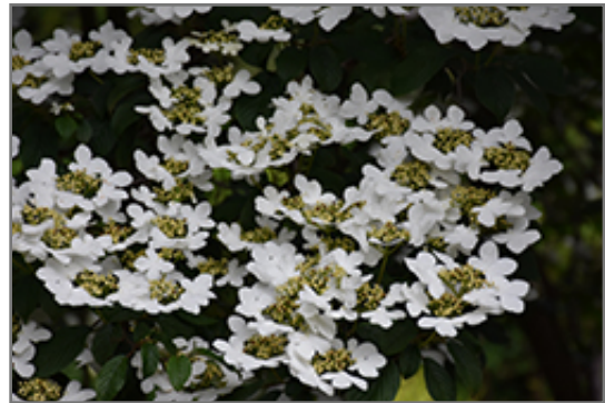
Summer Snowflake Doublefile Viburnum flowers