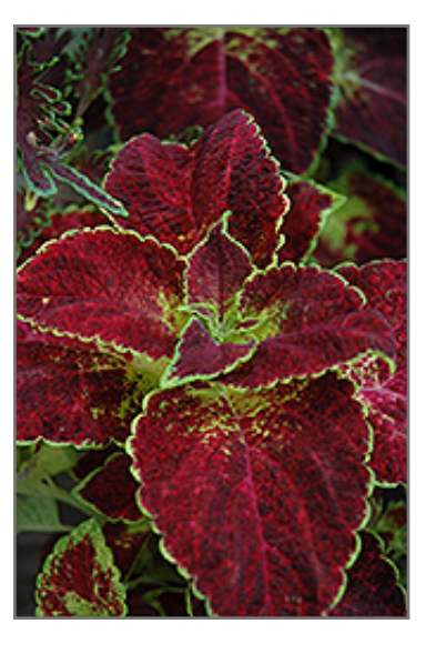
ColorBlaze Dipt in Wine Coleus foliage