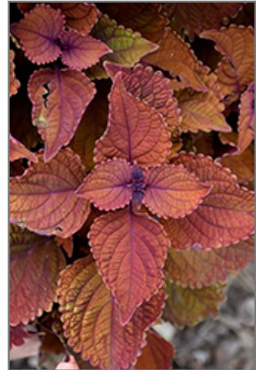
Wall Street Coleus foliage