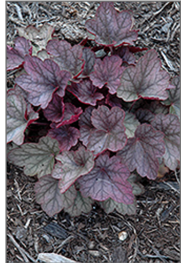
Carnival Rose Granita Coral Bells foliage

Carnival Rose Granita Coral Bells is recommended for the following landscape applications;