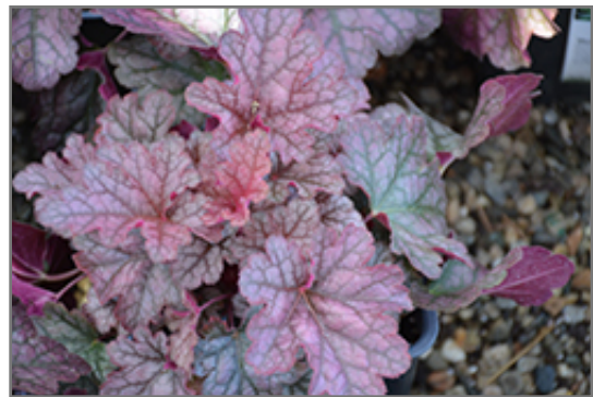
Kira Purple Rain Forest Coral Bells foliage