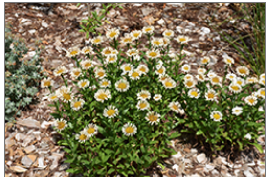
Lacrosse Shasta Daisy in bloom