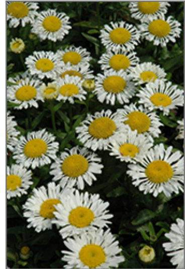
Lacrosse Shasta Daisy flowers