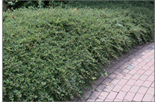
Coral Beauty Cotoneaster