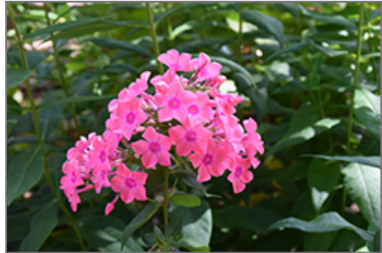
Flame Light Pink Garden Phlox flowers

Exceptionally long blooms of fragrant salmon-pink flowers with darker red centres, on compact plants that tend to be bushier; suitable for containers or small perennial borders; good mildew resistance