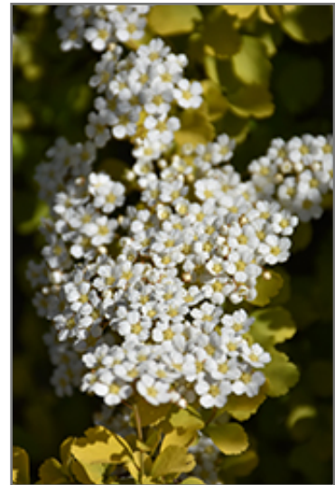
Glow Girl Birch Leaf Spirea flowers