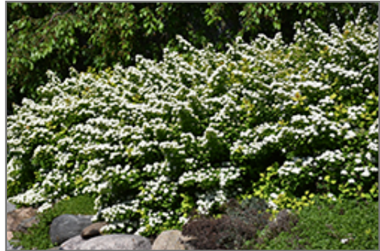
Glow Girl Birch Leaf Spirea in bloom