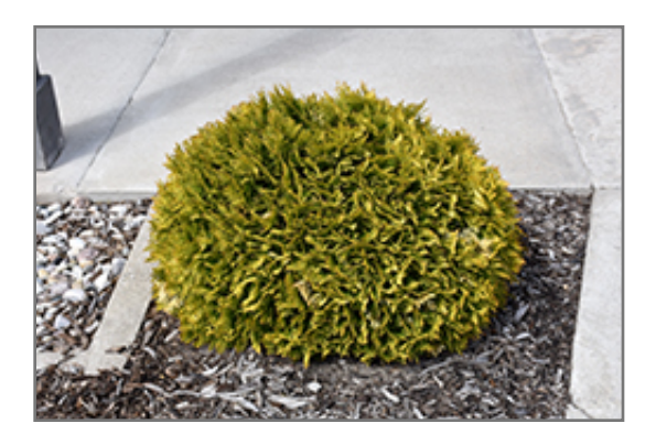
Anna's Magic Ball Arborvitae

Anna's Magic Ball Arborvitae is recommended for the following landscape applications;