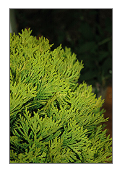
Anna's Magic Ball Arborvitae foliage