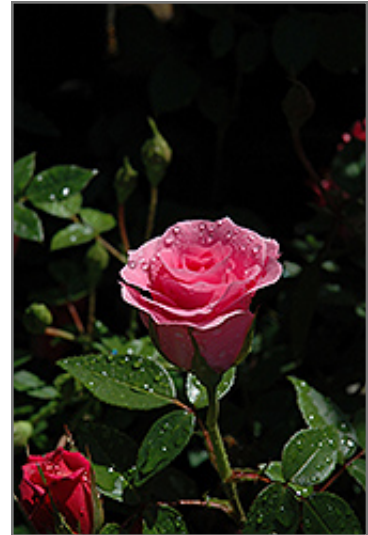
Belle Danielle Rose flowers