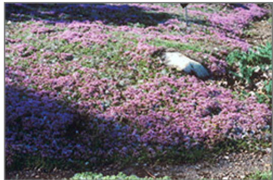
Mother-of-Thyme in bloom