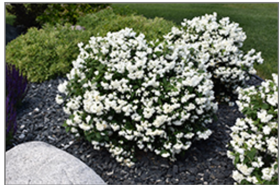
Snowbelle Mockorange in bloom