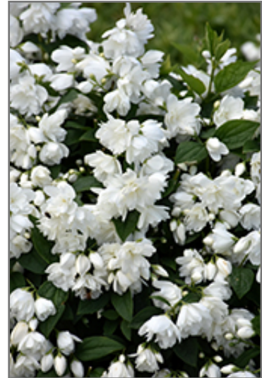
Snowbelle Mockorange flowers